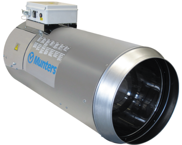
GA 30/95T front view

Munters GA 30/95T function according to the principle of direct-fired heating. As the air passes through the combustion chamber where the burner is located, 100% of the fuel is converted and transferred to the airflow. The maximum thermal efficiency reduces energy consumption and operating costs.