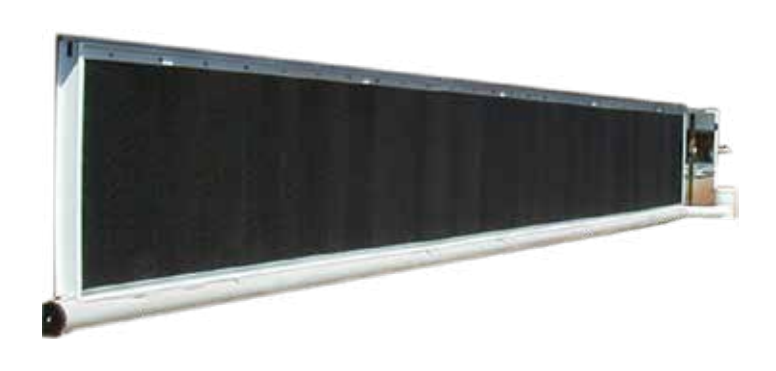
CT Cooling System

Munters systems utilizes the natural cooling effect of evaporation to efficiently cool the air entering your buildings. Combined with the windchill effect of tunnel ventilation, these systems improve production in the hottest weather. Modular pad assembly holds and wets a choice of pad materials for the ultimate in efficient and effective cooling. Inlet air temperatures can be reduced by 10-20 °F on most days, and even more under ideal conditions.