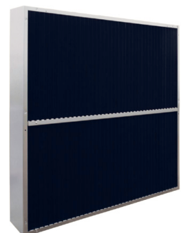
New LFd 50

Light filter is delivered unassembled in a package which optimizes the transport volume. The LFd comes in a strong carton box which assures a safe loading and optimize transport costs. While developing the new model Munters engineers focused on obtaining a product easy and fast to assemble. The results is a product which offers a 30% saving in assembly time in comparison with previous model.