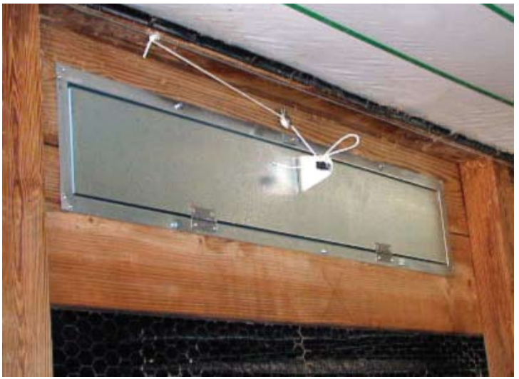
MI07xx Vent Doors

Increase the benefits from your ventilation system