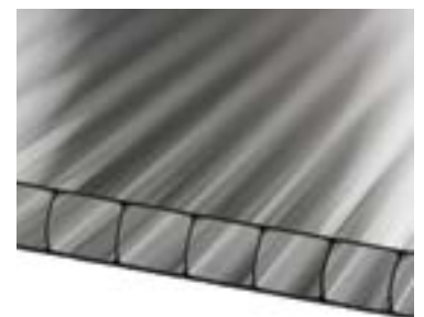
MVP - Munters ventilation panels

By choosing the ideal solution to provide natural ventilation for your barn/stable, you greatly increase the livestock welfare and thereby your production yield. Munters ventilation panels (MVP) provides an excellent combination of ventilation control and light requirements as an integral part of the natural ventilation for livestock stables and milking parlours.