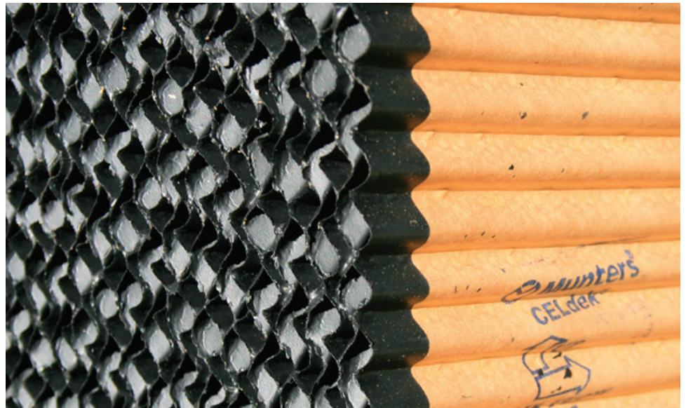
Munters MI-T-edg protects the CELdek pads from damaging effects of severe weather and UV light.

Munters MI-T-edg is nonporous and quick drying. It prevents algae and minerals from anchoring themselves into the substrate of the pad, so they slough off when dried. MI-T-edg also protects CELdek pads from the damaging effects of severe weather and long term exposure to UV light.