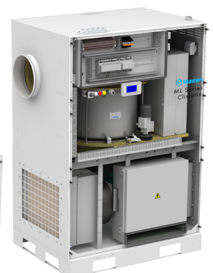
ML with Climatix Controls