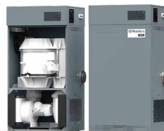
ML690 (APAC) with Munters AirC Note: The new AirC400 control panel will update gradually

This technology represents 60 years of innovation and application knowledge for perfect control of the dehumidification process.