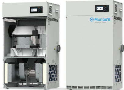
MLT1400 with Munters AirC

This technology represents 60 years of innovation and application knowledge for perfect control of the dehumidification process.