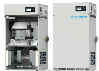
ML420 with Munters AirC

This technology represents 60 years of innovation and application knowledge for perfect control of the dehumidification process.