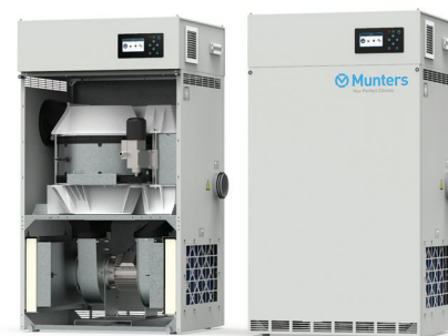
ML1350 with Munters AirC

This technology represents 60 years of innovation and application knowledge for perfect control of the dehumidification process.