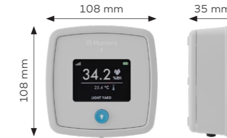
Sensor node with wall sensor