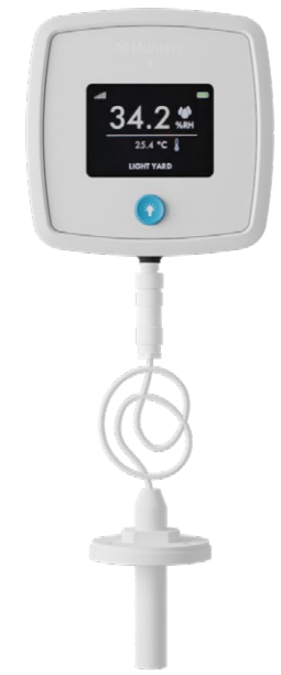
Sensor node with duct sensor