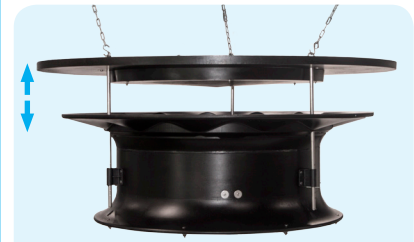
Variable Up/Down 0" – 12" Max Open

The sliding fan module on the Vario makes it possible to variably modify the recirculation gap.