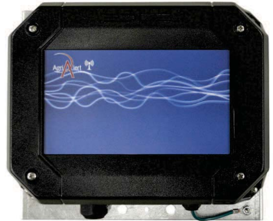
Wireless RS-485 Module

* Range of 1.2 miles (2 kilometers) open air unobstructed view.