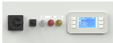
The new Climatix controller used in the kit has an easy-to-use interface, while keeping its original CE marking on the unit.

* This conversion kit is designed for ML17, ML23 and MLT30 units made between 2005–2015.