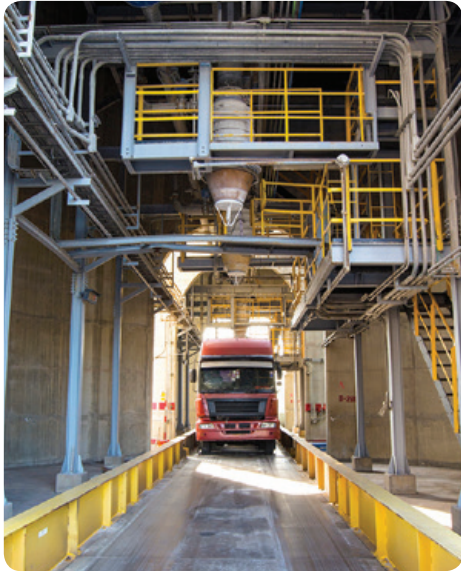
Dry air is fed into the blower used to convey ingredients from the truck to silos.

Hygroscopic ingredients are commonly stored in silos. If humidity is high or if condensation occurs inside the silo, the products become sticky and slowly build-up on the silo walls and clump together. If an ingredient and the surrounding air are in equilibrium, the moisture content of the ingredient is proportional to the relative humidity of the surrounding air.