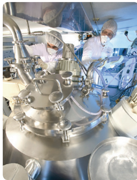
Desiccant dehumidification is used to provide dry air to the ingredient stream to keep ingredients dry and the mixing and blending process smooth.

As product is conveyed through the processing plant, sometimes different ingredients or materials require mixing before the final product can be reduced. As in all parts of the conveying process, if the materials or ingredients are moisture sensitive, moisture regain can cause production or product issues.