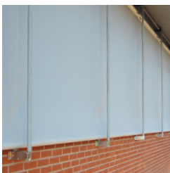
MSC wind protection pipes set