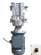
Pulling system with manual control