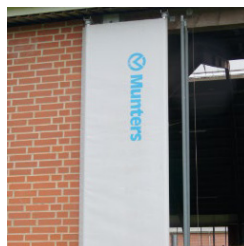
MSC wind protection set