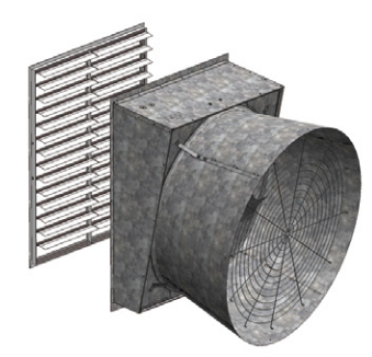
WF50 3D model

44 WF50 1,5hp wall exhaust fans with discharge cone create air speeds inside the house exceeding 3m/s during the cross ventilation. Thanks to the high wind chill effect cow comfort is considerably improved. Removable plastic shutter allows for easy access for maintenance and cleaning purposes