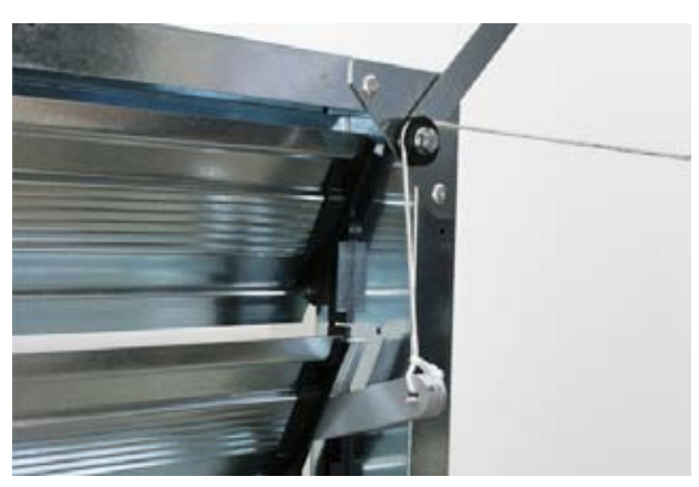
Each SMT can be fitted with an arm, which is connected to a common actuator for simultaneous opening and closing.