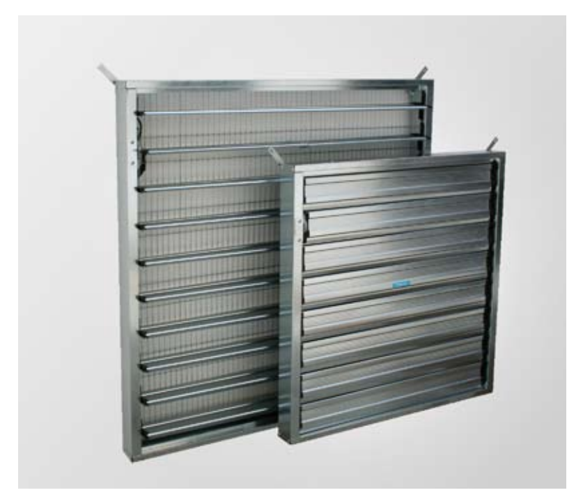
SMT inlet shutters are designed for use as fresh-air intakes for livestock housing and greenhouse.