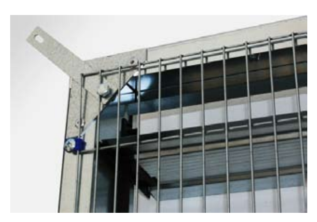
SMT fitted with guard mesh to prevent wild animals and birds from entering.