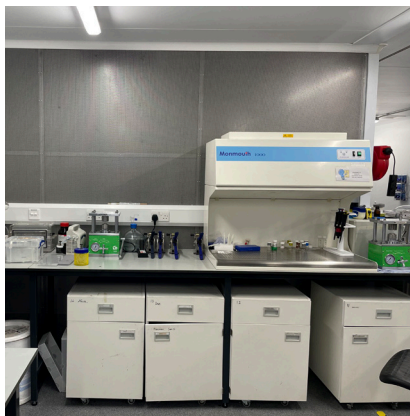
Air is supplied through the wall.