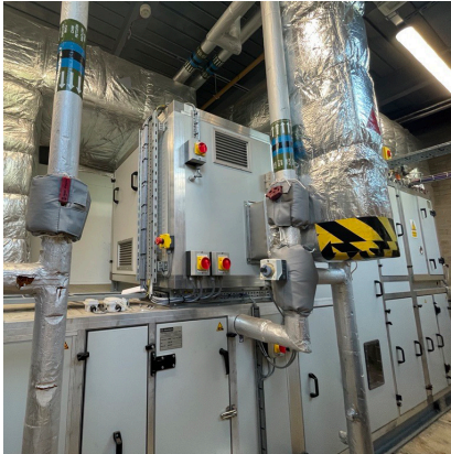
The Munters desiccant dehumidification system installed in the plant room.