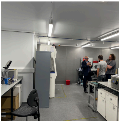
Inside the dry room.