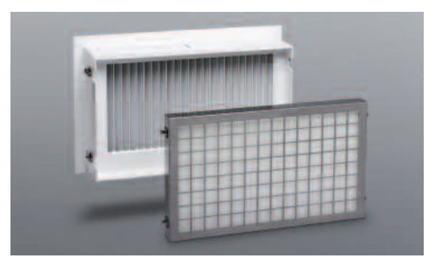
PBF35 with additional filter.

This unit is designed for very high liquid removal applications and offers salt and dust filtration of up to 98%. The additional filter stage provides an extra level of protection that is often needed when boats are operated in highly saline or sandy areas.