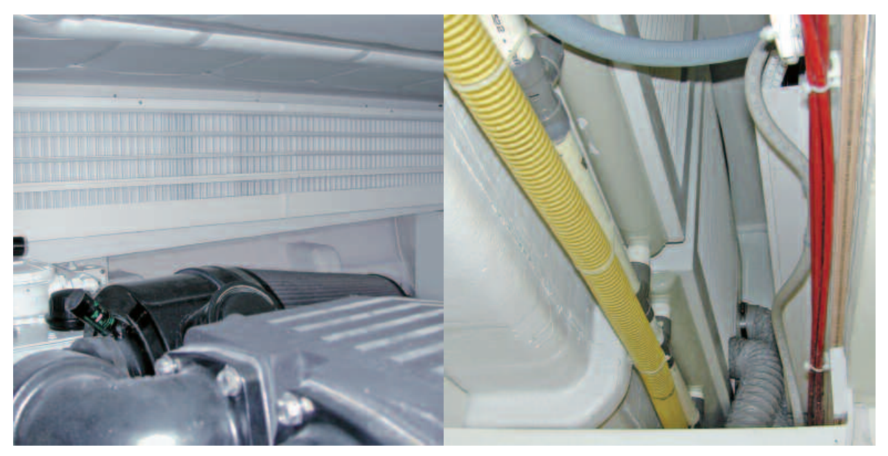
PB35 installed to protect the engine room.