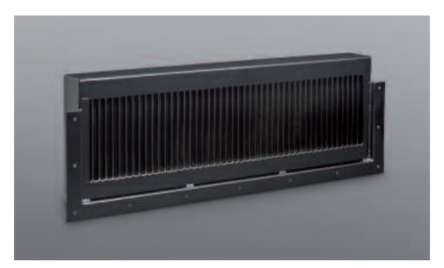
PB35 in customized black.

Available in aluminum only, this mist eliminator requires just 97 mm for installation, permitting fitting into the most confined of hulls, while still offering excellent water handling capacity.