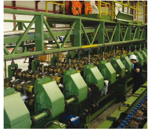
Decontaminated production line.

Munters have for years, been achieving a restoration rate in excess of 50% and for light and medium damaged machine, a rate of over 96% - not just delivering significant cost savings to everyone concerned but also considerable environmental benefits by reducing disposal volume and the inherent costs associated with the manufacture of replacement goods.