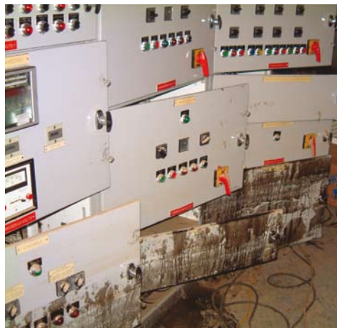
Awaiting reconditioning following a fire.