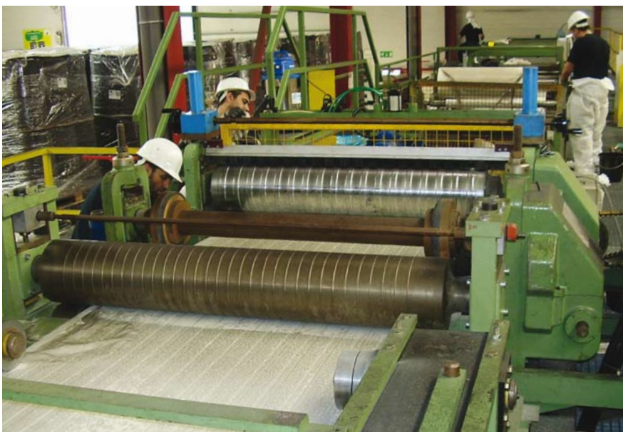
Technical reconditioning of a steel forming production line.

In the presence of heavy contamination, a chemical procedure can be used. Chemical procedures guarantee the removal of chemical contamination, the removal of corrosion products, passivation of metal surfaces and avoid damaging any protective coatings. In case of slight contamination and powdered parts, dry procedures such as 'brushing and sucking' or carbon dioxide blasting are considered.