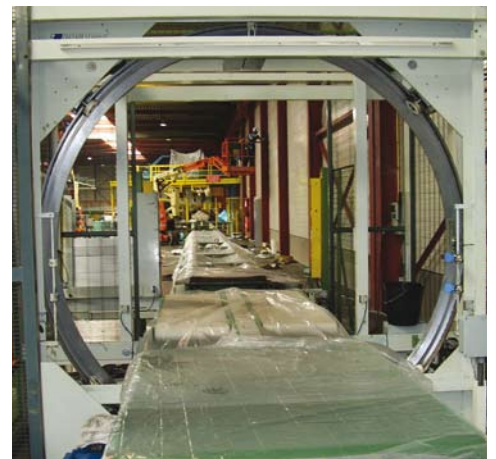
Stabilisation of production line.