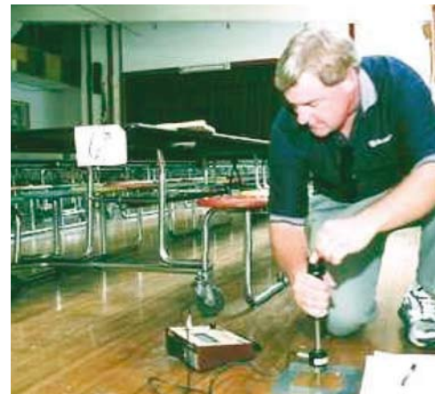
Monitoring the drying process.