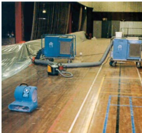
Restoring a sports hall floor.