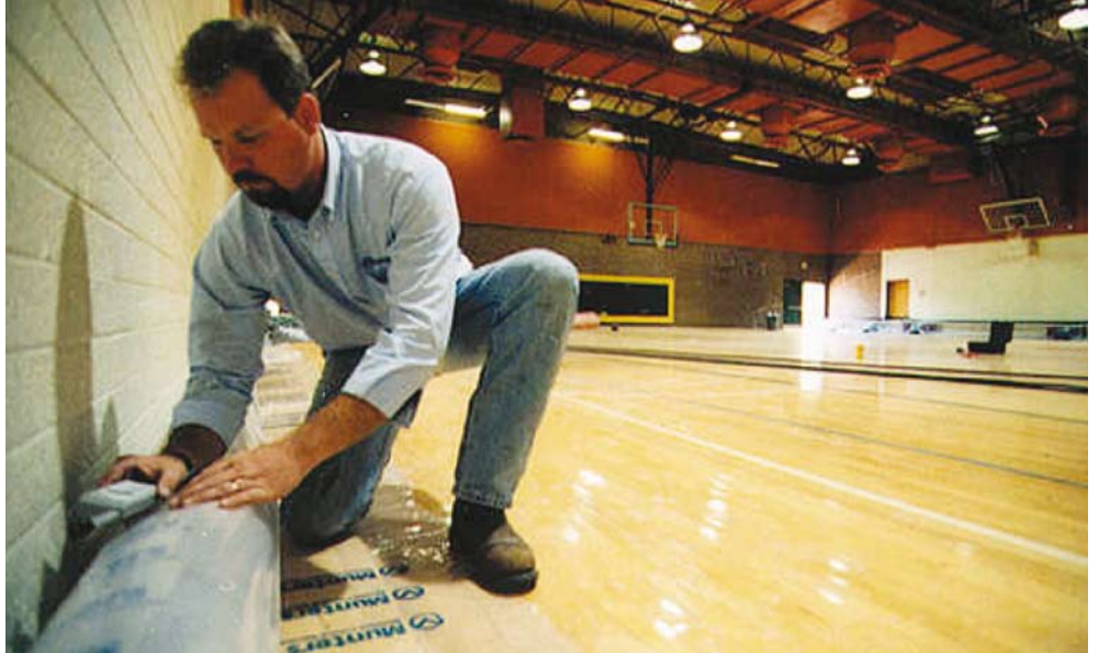
A Munters technician takes a moisture reading.

Maintaining stable moisture levels ensures a continuous drying process and by controlling this process Munters' technicians are able to assure that the building is completely dry.