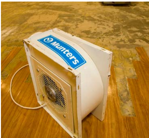
Munters equipment in position.

The timescale for restoration is often much shorter than the replacement time and also attracts a significant cost saving.