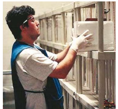
Checking the quality during the drying process.