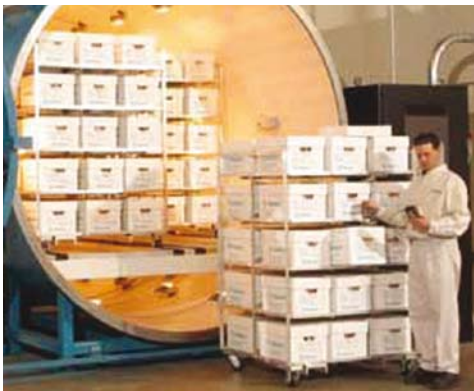
Vacuum drying chamber. The most effective way to dry documents today.

In many situations Munters is able to provide on site drying facilities at the client's site, ideal for confidential files and information that are required on a regular basis or that, for legal reasons, must remain at the site.