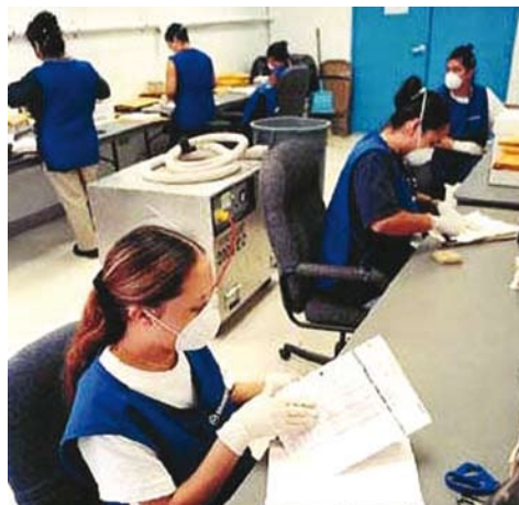
Cleaning documents after drying.