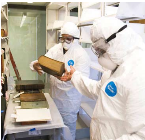
Recovery of books damaged by mould.