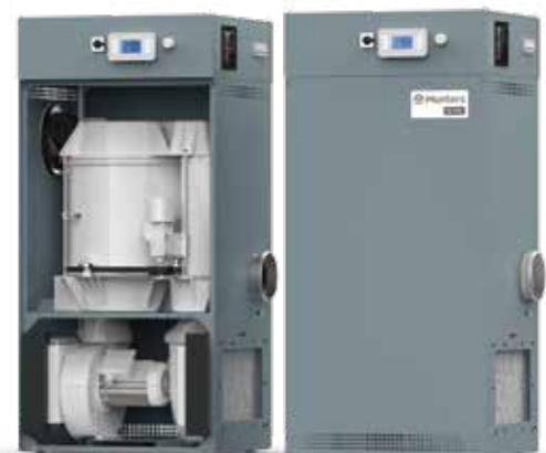
ML APAC with Climatix Controls

ML Series dehumidifiers conform to both harmonised European Standards and to CE marking specifications.