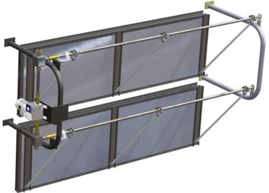
Horizon Tunnel Door

Available in door sizes of 36" or 42" heights and built to any length the system can fit any sized building opening. Custom engineered designs to maximize the actuator capabilities, along with years of experience with rack and pinion applications make this system uniquely suited for the tough conditions of the layer market.