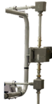
Powder coated framework and actuator

The framework is entirely powder coated with the support tubes and brackets welded in place to precisely locate your motor and rack and pinion system. This makes assembly very easy with no guess work or sliding clamps.