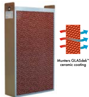
Munters GLASdek GX40

GLASdek GX40 is provided in cassettes that are tailored for use with the FA6™ frame system. FA6 comes in a wide range of standard sizes that conform to all typical air handling unit dimensions.