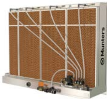
GX40 media assembled in Munters FA6™ humidifier.

FA6 guarantees optimal cooling performance thanks to low pressure drop, low operational costs and no risk of over-saturation. Also the system is completely safe and hygienic. It is certified to ISO 9001, and the modular nature of the system means it's easy to install, service and clean.