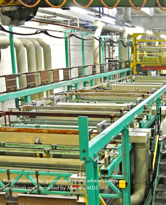
Production hall for galvanized plates where climate conditions are controlled by Munters MDS unit.