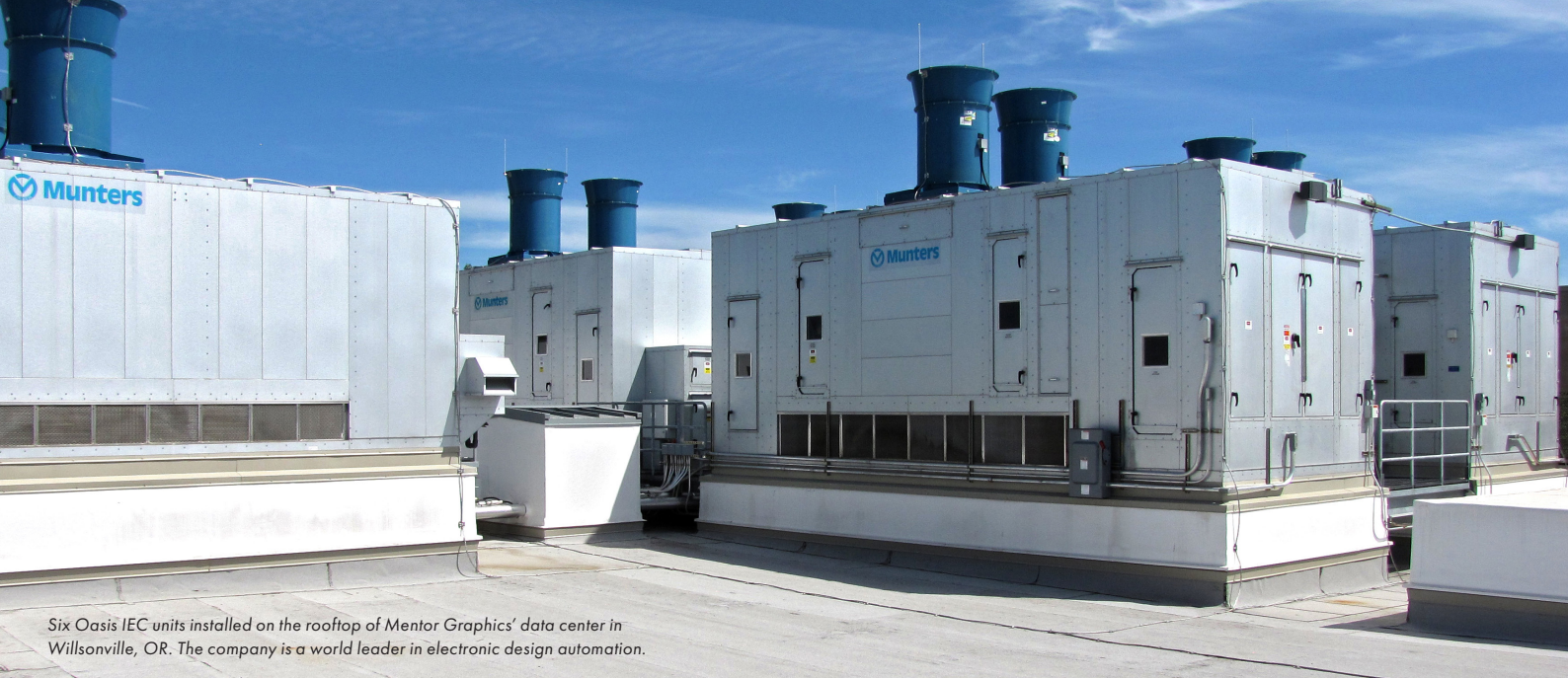
Six Oasis IEC units installed on the rooftop of Mentor Graphics' data center in Willsonville, OR. The company is a world leader in electronic design automation.

Founded in 1981 and acquired by Siemens in 2017, Mentor Graphics Corporation (MGC) is a leader in Electronic Design Automation (EDA) technology. To improve efficiency and meet growing demand, MGC decided to consolidate several small data centers into a single, larger data center. This new, state-of-the-art data center was built at company headquarters, located in Willsonville, Oregon, roughly 18 miles south of downtown Portland.