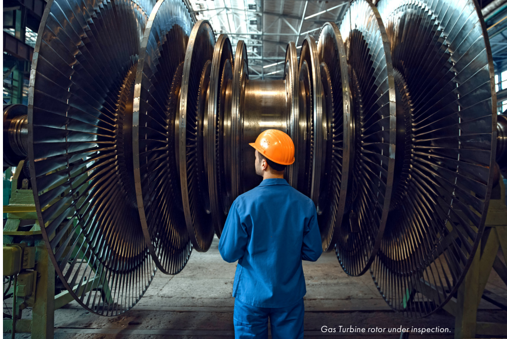
Gas Turbine rotor under inspection.