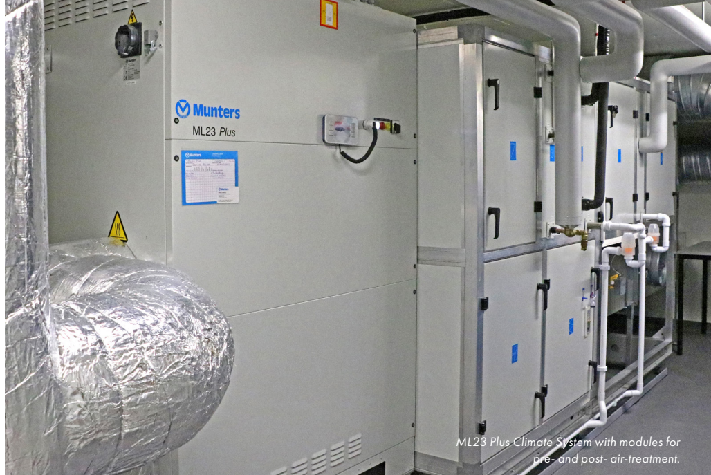
ML23 Plus Climate System with modules for pre- and post- air-treatment.