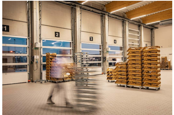
Pistoles and bread retain optimal texture when they are transported.