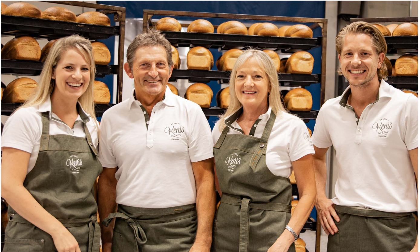
Kenis Bakery started as a family business in 1986.

Passionate bakers known for their delicious breads and pastries, the team at Kenis Bakery, a cherished family-owned bakery based in Belgium faced a challenge during the hot summer months. The existing air treatment system in their production facilities was unable to control the relative humidity, which affected product quality.