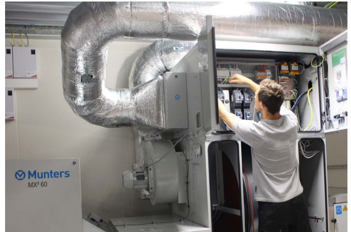
Munters service engineer sets up the MX 2 60 at Kenis Bakery.

The MX 2 60 also features an innovative option that harnesses heat from a technical room for rotor regeneration, enabling Kenis Bakery to not only benefit from improved air quality and energy efficiency but also combine sustainability with cost savings.