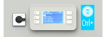
The new Climatix controller has an intuitive full-color interface, while keeping its original CE marking on the unit.

With decades of experience leading the dehumidification industry, we know what it takes to ensure the perfect climate for our customers. Trust Munters, convert today to keep your ML unit running like new!