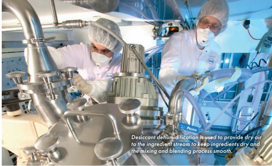
Desiccant dehumidification is used to provide dry air to the ingredient stream to keep ingredients dry and the mixing and blending process smooth.